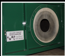
NEW - Bin Hole Reducing Diaphragm