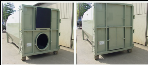
Hinged Metal Auger Hole Cover