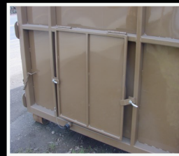
Bin Liquid Drain