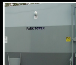
Fire Hose Ports